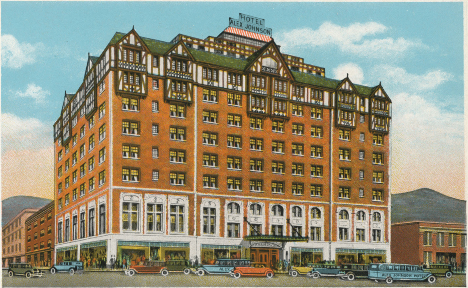
33 ALEX JOHNSON HOTEL, RAPID CITY, S. D.