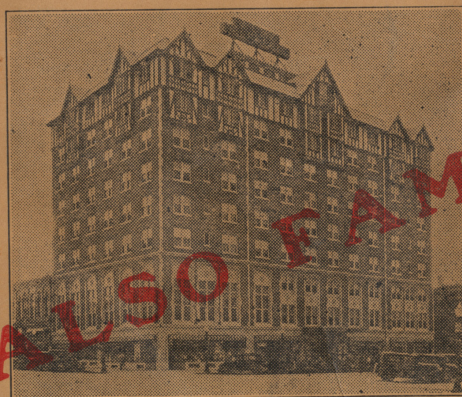
Gateway to the Black Hills