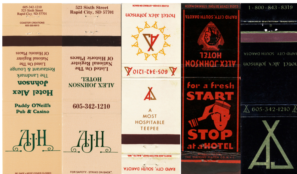
Historic Match Book Cases

When the hotel was first built, there was a solarium on the 10th floor with an observation tower, later used by KOTA Radio station. Today, the 10th floor is an upscale rooftop Vertex Sky Bar for club members and hotel guests. Some people are lucky enough to be able to leave work at five o'clock and catch the glorious window of time known as happy hour. For Vertex members and guests, however, every hour at the rooftop bar is happy. Equal parts cool and comfortable, Vertex blends modern bar features with traditional architecture, resulting in a truly one-of-a-kind venue.